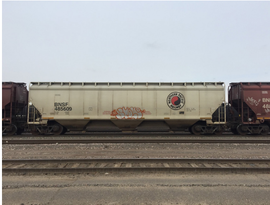
NP Covered Hopper.