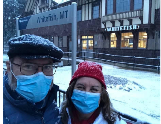
Practicing Safety First.jpg