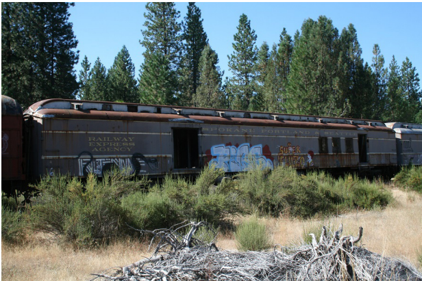
SP & S head end cars