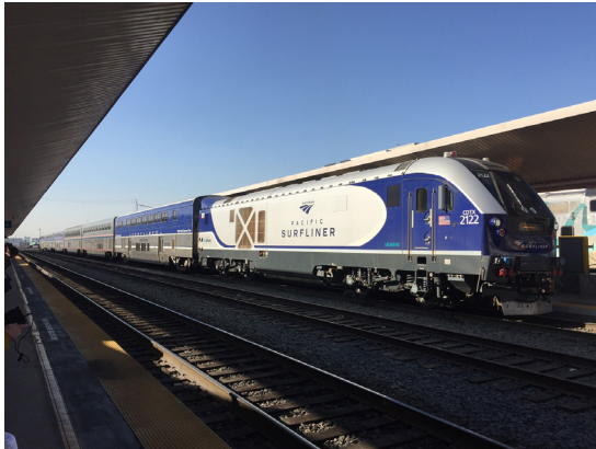
LA Union Station.