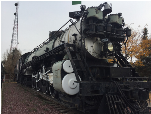
GN 2584 Harve, MT.