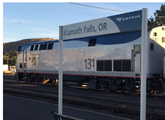
Klamath Falls, OR.