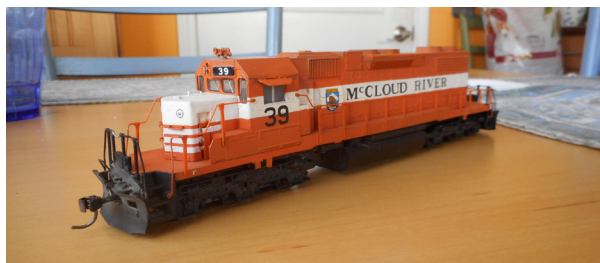
My McCloud River SD39-2