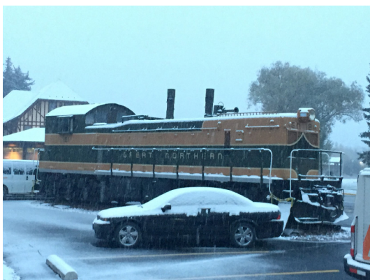
GN Switcher in Whitefish, MT.