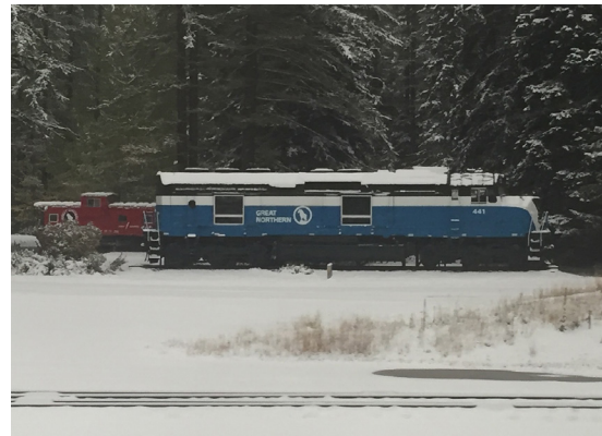
GN at the Izack Waltin Inn, Glacier.