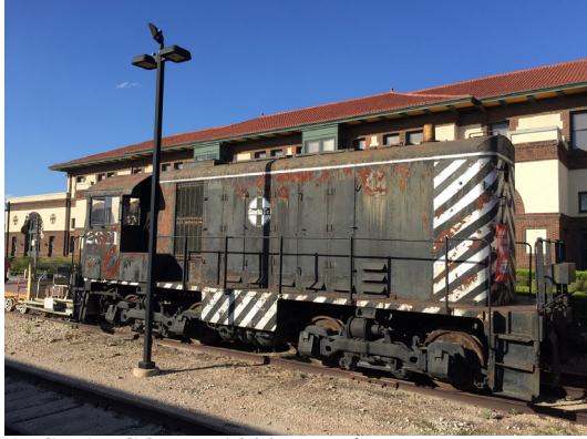
ATSF ALCO HH-1000 Temple, TX.