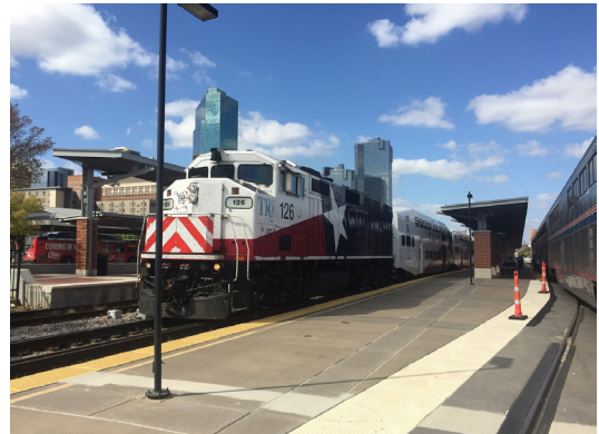
TRE Commuter Fort Worth, TX.