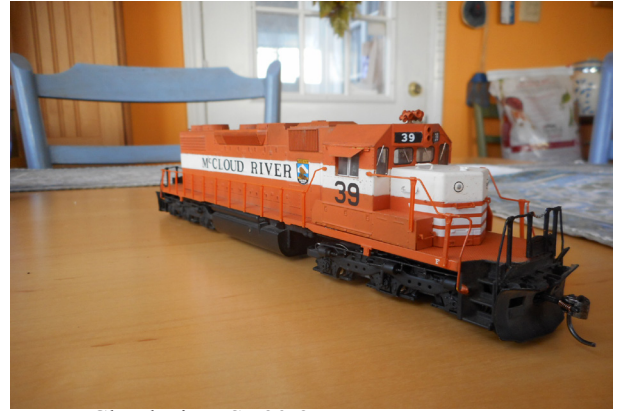
My McCloud River SD39-2