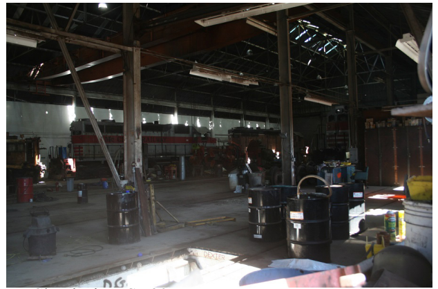
McCloud River SD39s