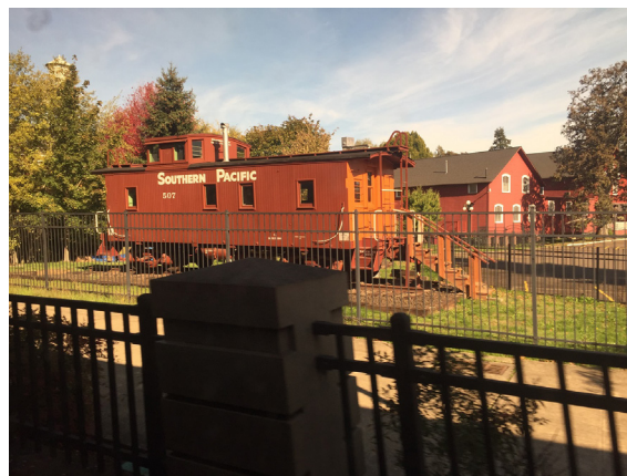
SP Caboose Salem, OR.